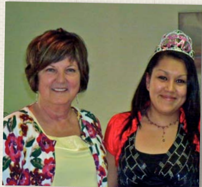
Celebrating her graduation from High School